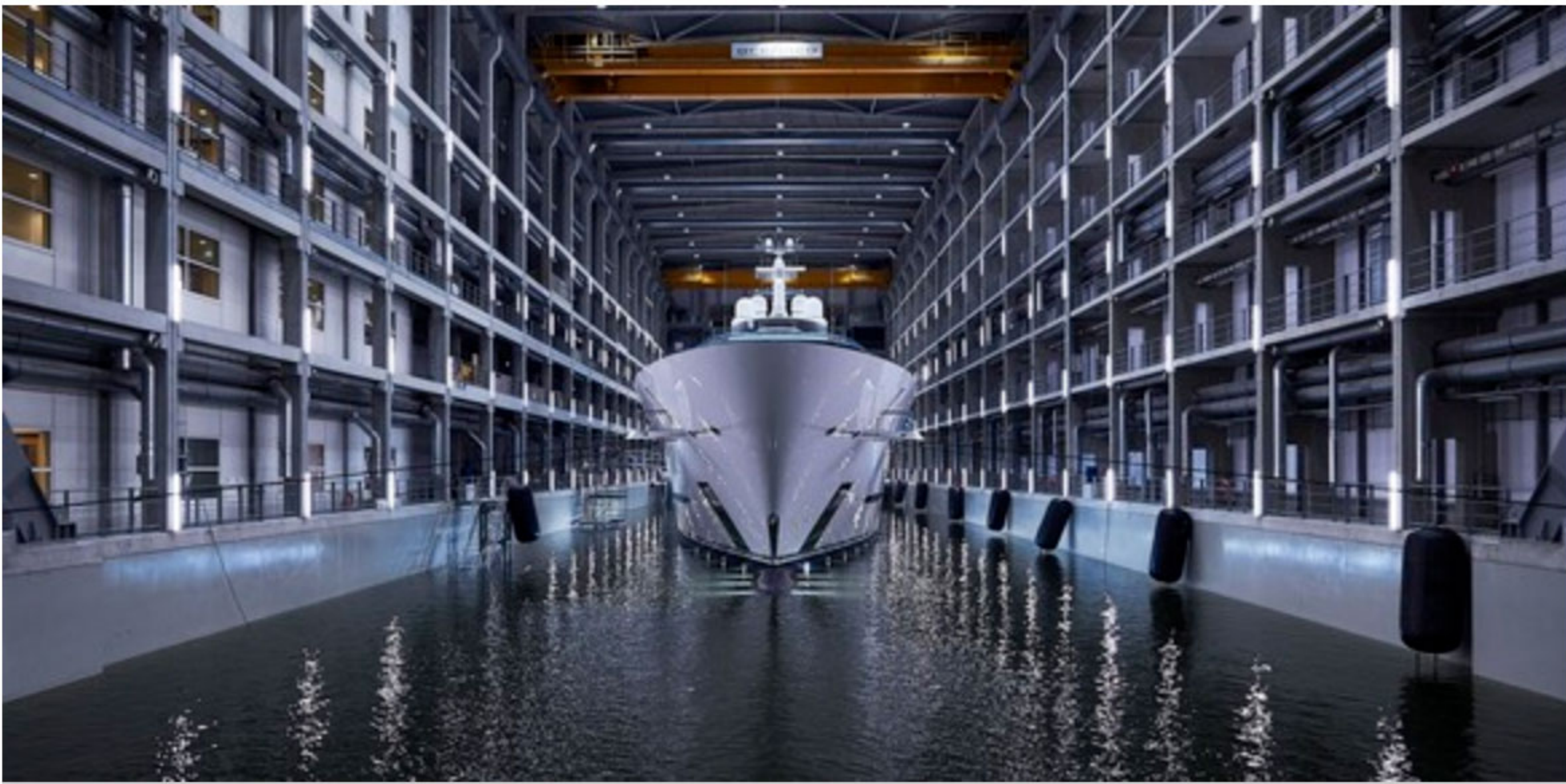
Jubilee: Photo © Francisco Martinez Photography