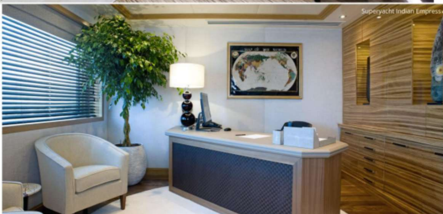
Superyacht Indian Empress