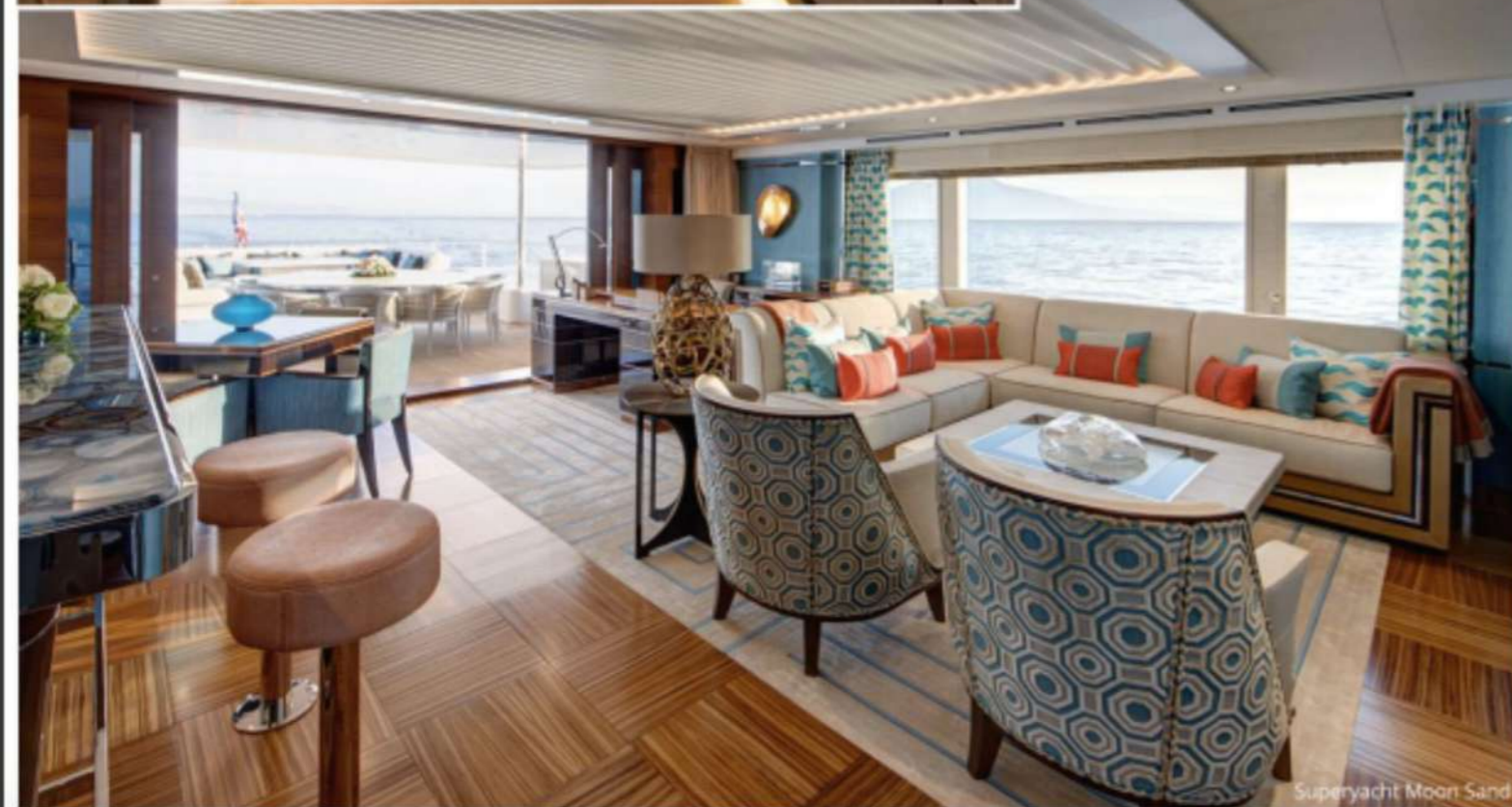
Superyacht Moon Sand