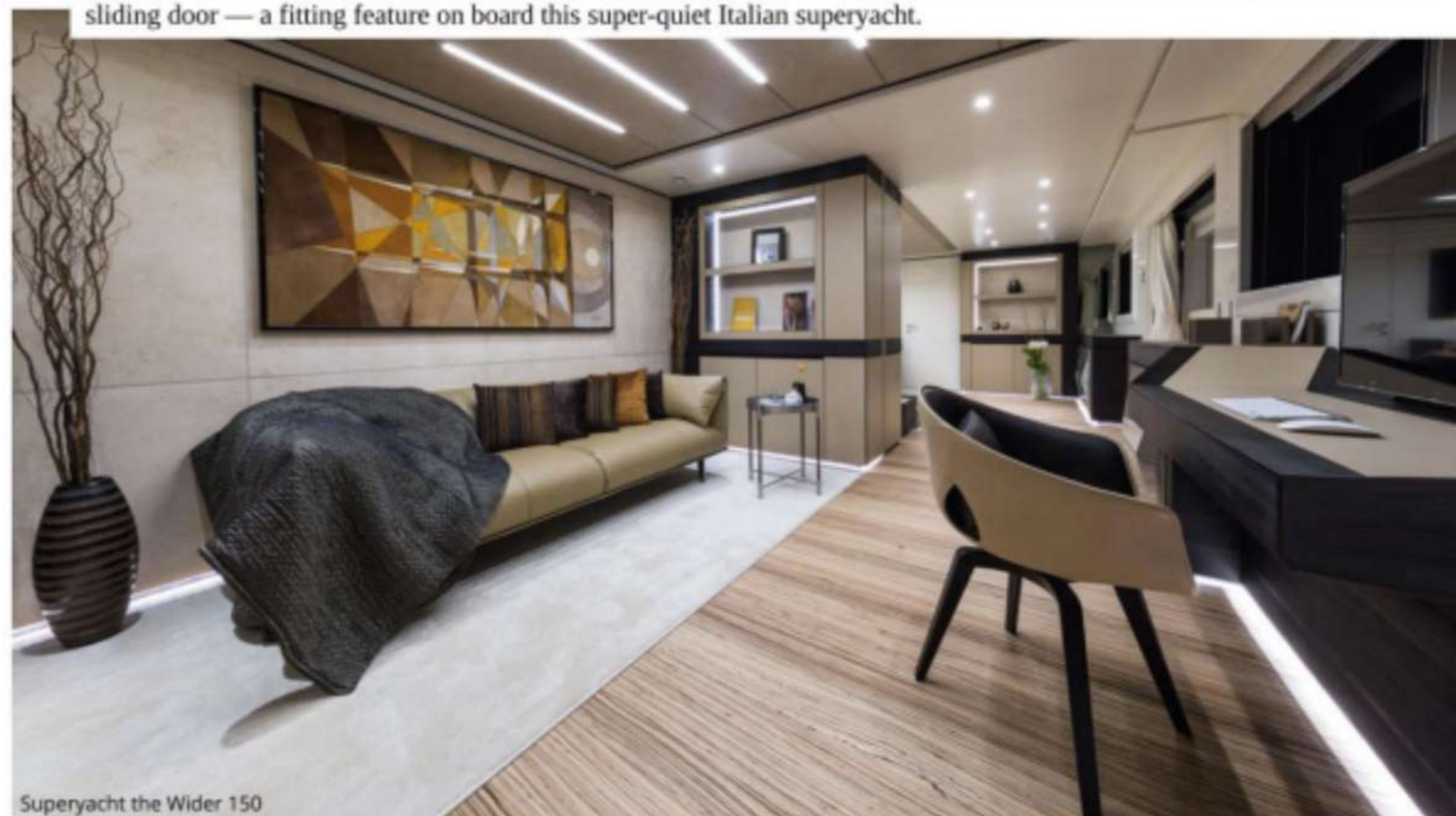
Superyacht the Wider 150

The study on this 46m from Wider Yachts can be shut off from the owner's suite at the touch of a button via a soundproof sliding door — a fitting feature on board this super-quiet Italian superyacht.