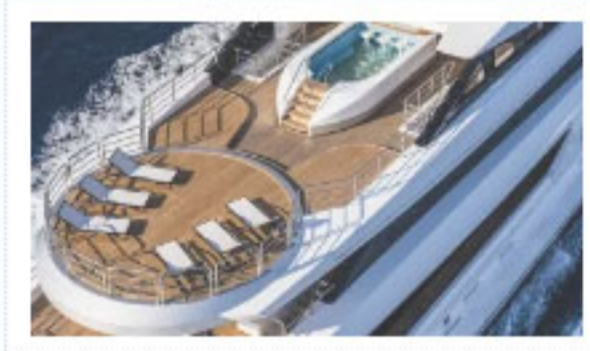
Suerte, First Tankoa Launch: Gallery August 12, 2015 In "Motoryachts"