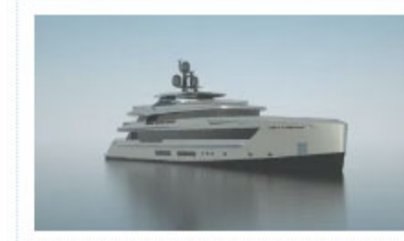
Tankoa S531 and S532: New Designs December 1, 2015 In "Motoryachts"

MOTORYACHTS, YACHTS EXCLUSIVA DESIGN, TANKOA YACHTS. PERMALINK.