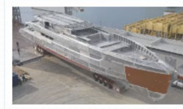
Transporting the Tankoa S501: VIDEO August 25, 2016 In "Videos"