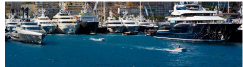
Photo gallery of Monaco Yacht Show 2015