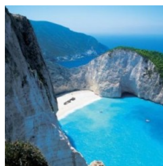
Vacations that Will Change Your Life