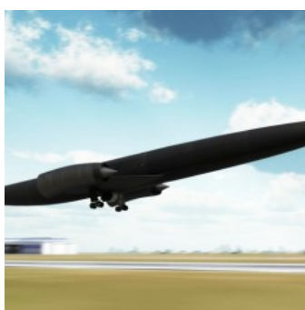
Fly London to Sydney in 4 Hour With New Jet Engine