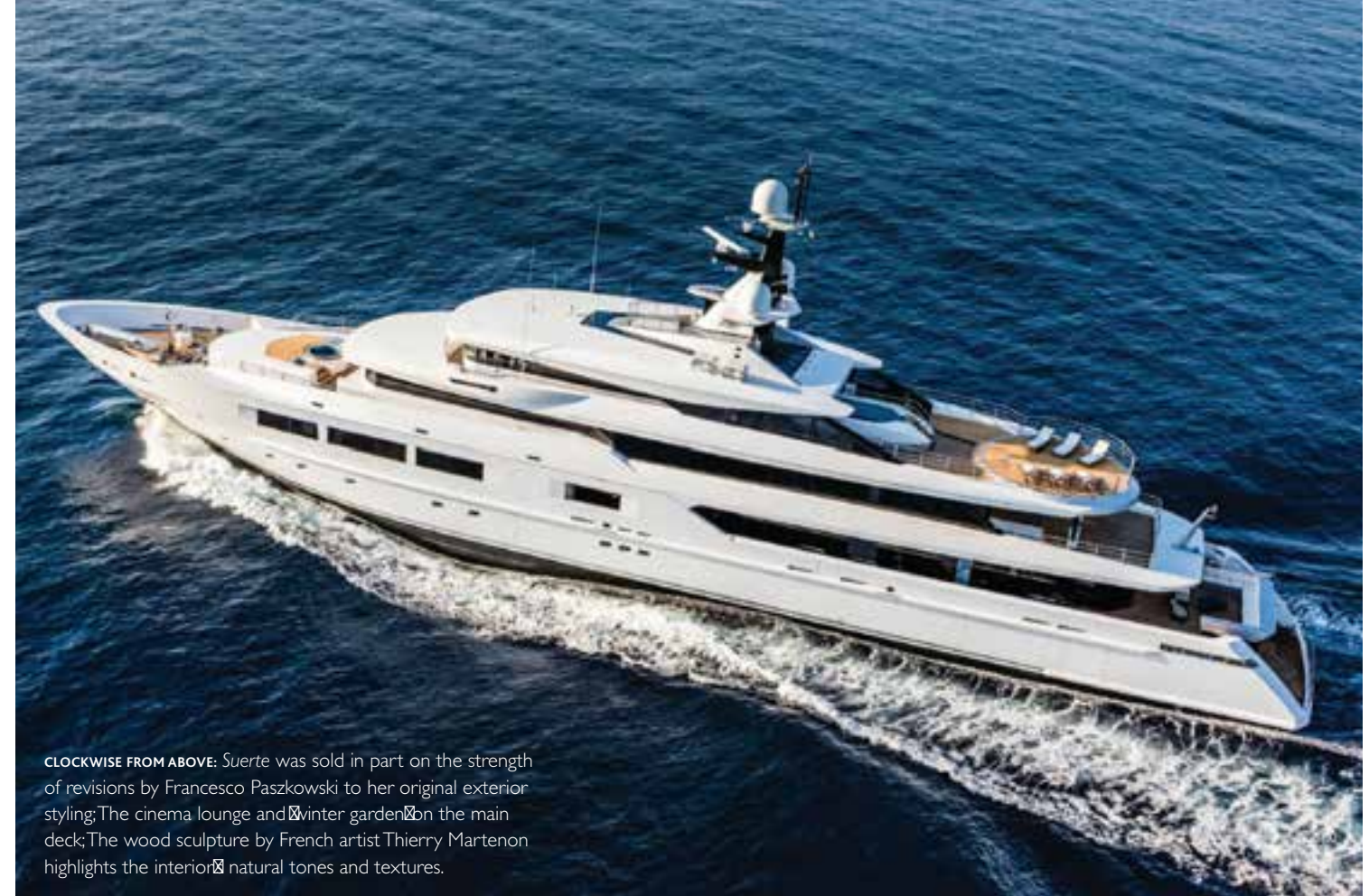
CLOCKWISE FROM ABOVE: Suerte was sold in part on the strength of revisions by Francesco Paszkowski to her original exterior styling; The cinema lounge and winter garden on the main deck; The wood sculpture by French artist Thierry Martenon highlights the interior's natural tones and textures.