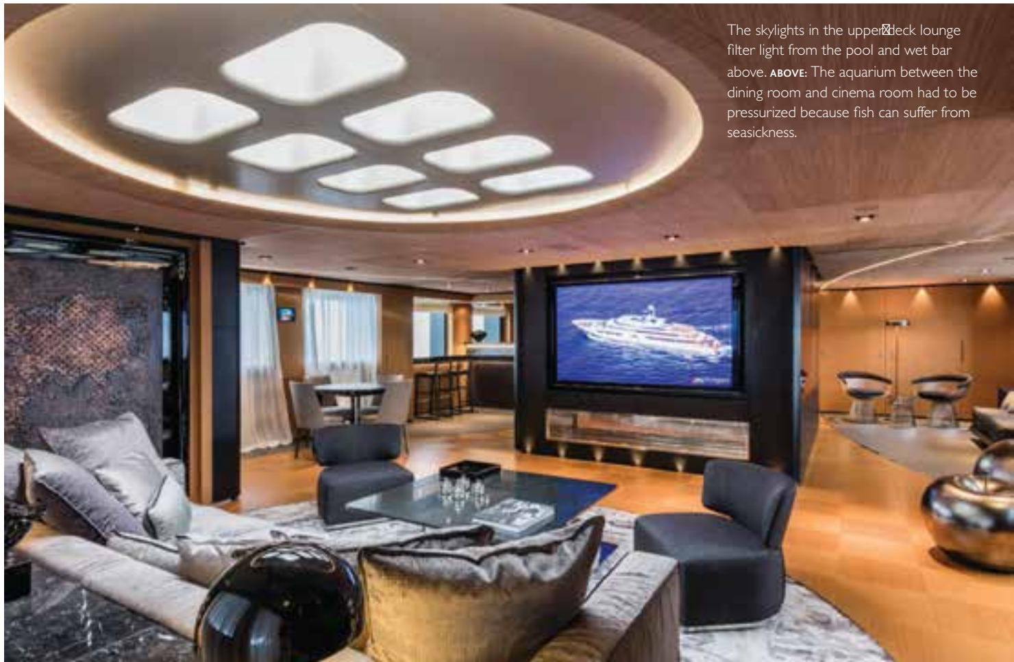
The skylights in the upper deck lounge filter light from the pool and wet bar above. ABOVE: The aquarium between the dining room and cinema room had to be pressurized because fish can suffer from seasickness.