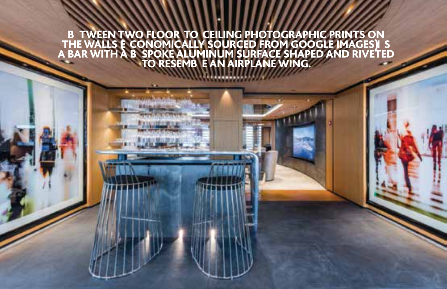
BETWEEN TWO FLOOR TO CEILING PHOTOGRAPHIC PRINTS ON THE WALLS (ECONOMICALLY SOURCED FROM GOOGLE IMAGES) IS A BAR WITH A BESPOKE ALUMINUM SURFACE SHAPED AND RIVETED TO RESEMBLE AN AIRPLANE WING.

A central staircase opens into the main salon, which is divided into two zones. Full height glazing with louvered blinds provides a Japanese style winter garden overlooking the aft deck. Between two floor to ceiling photographic prints on the walls (economically sourced from Google Images) is a bar with a bespoke aluminum surface shaped and riveted to resemble an airplane wing. The bar area leads into a cinema and chill out room with seating for 16 people to watch movies on the curved, 88 inch, 4K TV screen. Integrated into the bulkhead adjoining the dining room is a 265 gallon tropical aquarium. Amazingly, it was discovered that fish can suffer from sea sickness, so the tank had to be pressurized to reduce the movement of the water inside.